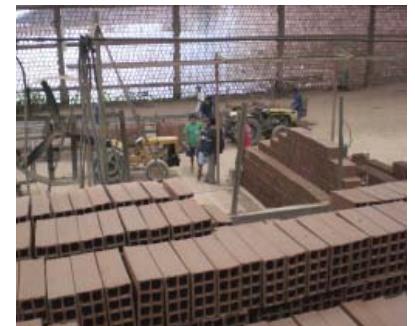
Vila Nova site

Through this project a number of employment and training opportunities have been created including 36 temporary construction roles and nine permanent operating roles.