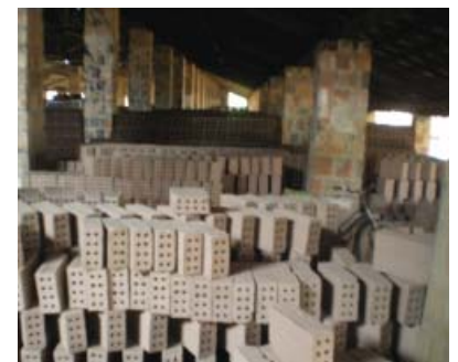
São Silvestre site

These images have been provided by individuals working with the project operators