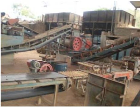
Sao Silvestre site