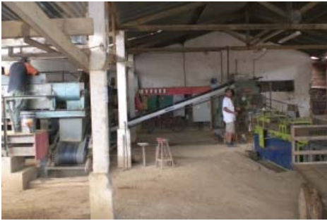
Nova Dutra site