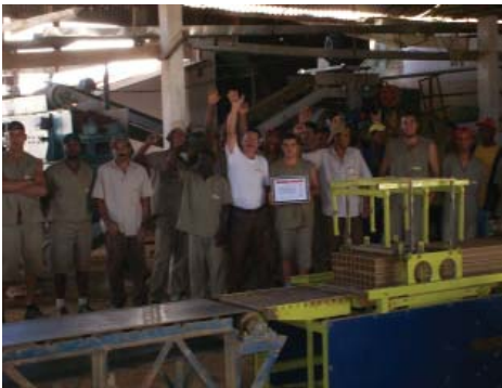
Nova Dutra site

These images have been provided by individuals working with the project operators