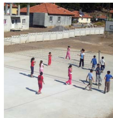
These images have been provided by individuals working with the project operators