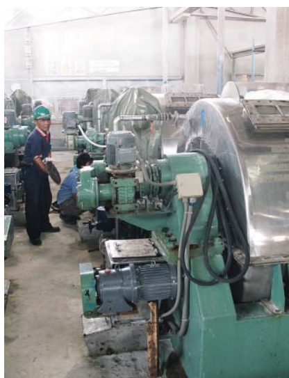
These images have been provided by individuals working with the project operators