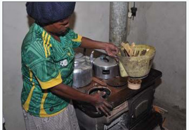
A project member using the Basa Magogo technique.

Successful implementation of the project, which started in 2009 and will run for 10 years, will lead to more efficient use of coal resulting in reduced coal consumption and greenhouse gas (GHG) emissions. The ultimate goal, at the end of the 10 year period, is to replace the old ignition technique with the more efficient Basa Magogo method.