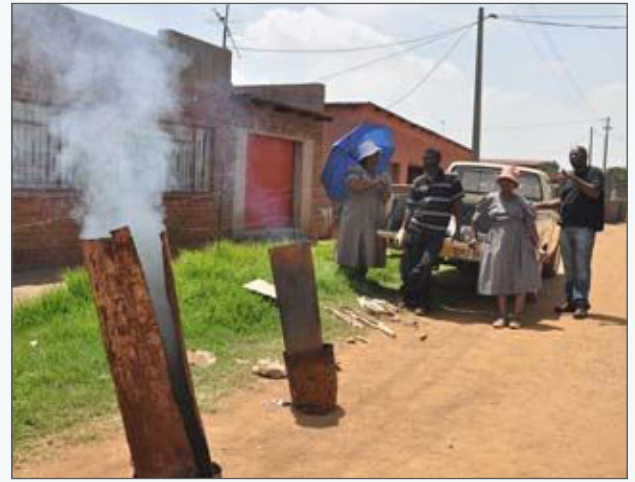
On the left is the old method, and the Basa Magogo method is on the right.